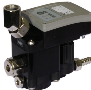
NED-LC level controlled drain

There is simply no application nano drains cannot handle. Whether on a drop leg, a compressed air filter or anywhere condensate collects in the compressor room or on the plant floor, nano has the condensate drain to suit your needs.