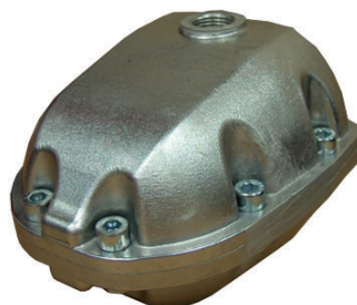
NMD magnetic drain