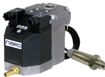
NHD heated drain