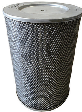
E 0250 to 5000

(2) for condensate drain options, consult nano